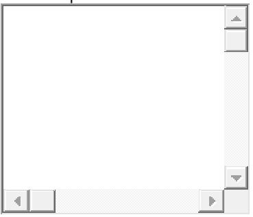
There is a limit of 250 characters

Further comments on the overarching challenges that have informed the development of the ETP so far.